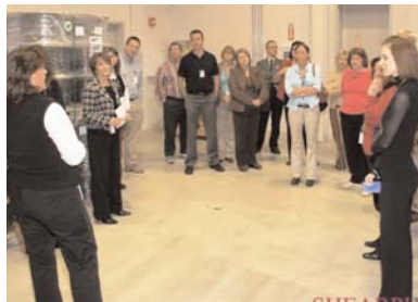
Educators tour warehouse at Time Warner Cable.

Middle . "It's often hard for middle school students to comprehend that what they are learning in the classroom will be valuable to them in the future. Having these industry professionals stress the importance of