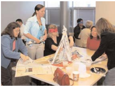
Educators participate in hands-on learning activity as part of MEBA field study.

More than 600 middle and high school educators from School District Five of Lexington and Richland Counties participated in a special MEBA field study on February 18, 2008. The school district and MEBA partnered