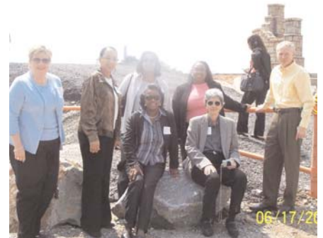
Midlands educators tour Dreher Shoals Dam at Lake Murray.