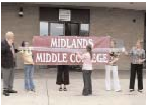
Students from the Midlands Middle College cut the ribbon to celebrate the start of a third successful year.