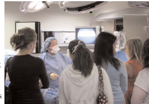
Students learn about surgical technology.