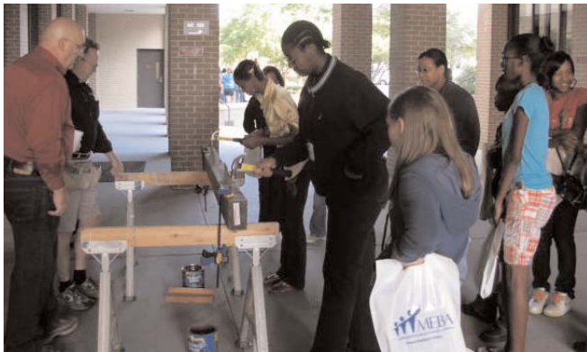
Students participate in a Construction "Hammer" Contest as part of MEBA's Engineering & Industrial Technologies Career Day.